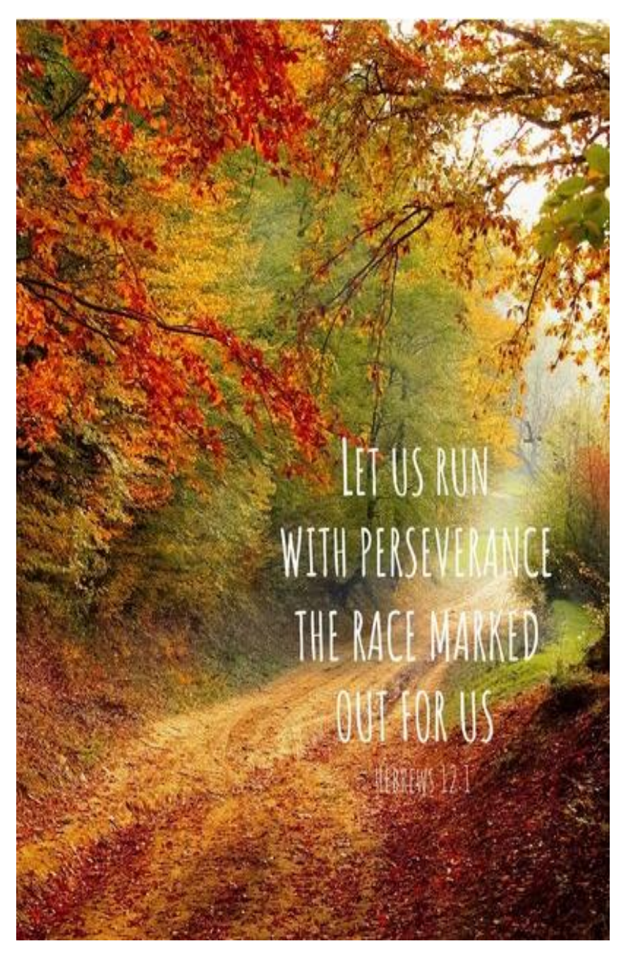
Great Swamp Baptist Church November 3, 2024