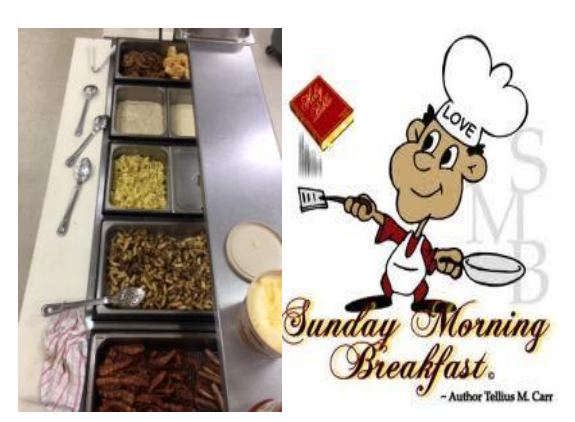
Sunday Morning Breakfast

Breakfast will be served from 8:30 a.m. to 9:00 a.m. $5.00 per person or $15.00 per family of four or more.