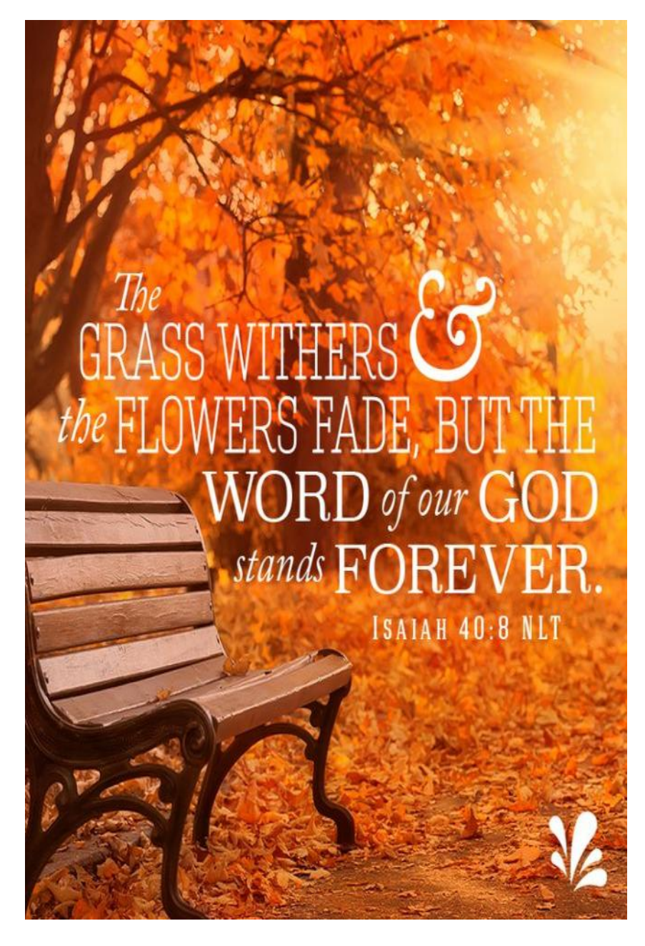
Great Swamp Baptist Church November 17, 2024