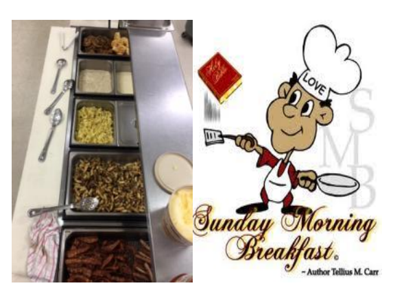
Sunday Morning Breakfast

Breakfast will be served from 8:30 a.m. to 9:00 a.m. $5.00 per person or $15.00 per family of four or more.