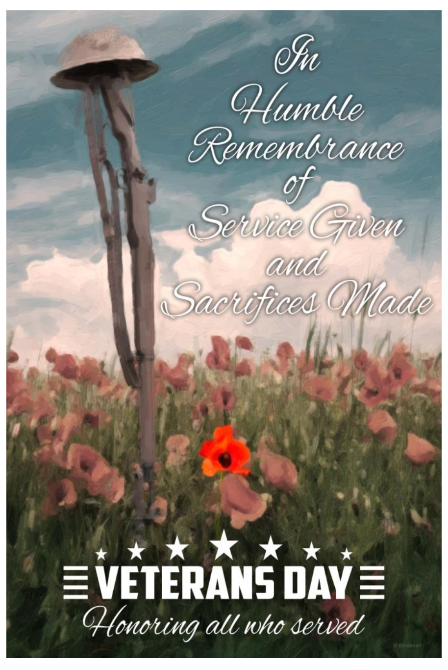
Great Swamp Baptist Church November 10, 2024