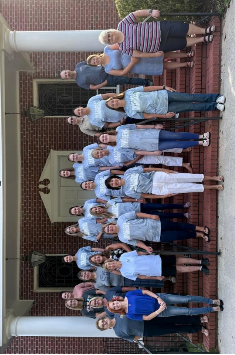
Great Swamp Baptist Church August 13, 2023