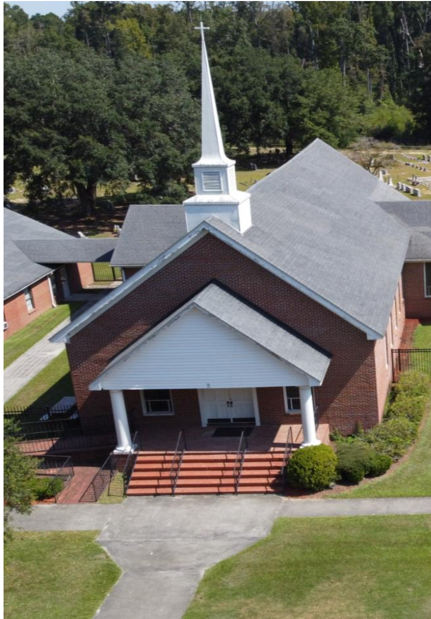
Great Swamp Baptist Church October 16, 2022