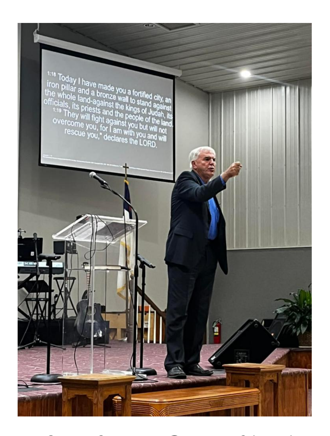
Great Swamp Baptist Church August 14, 2022