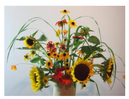
The flowers placed in the church today are by the Gleaners Sunday School Class