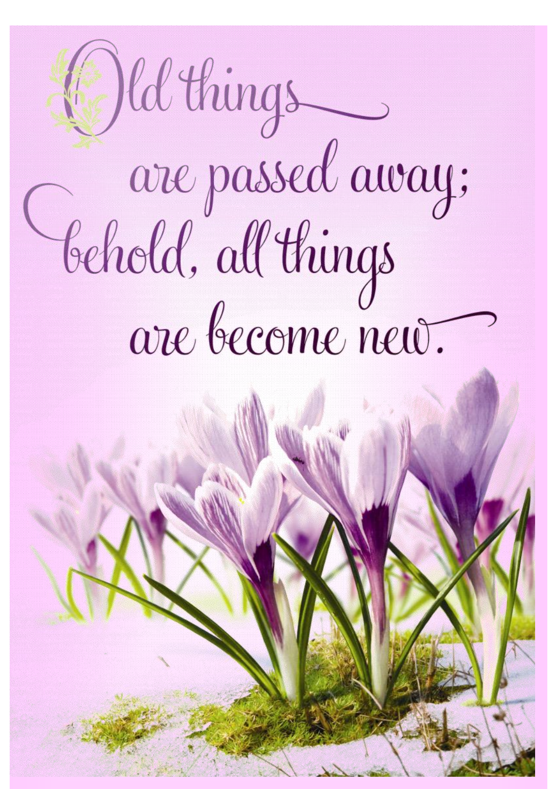
Great Swamp Baptist Church March 13, 2022