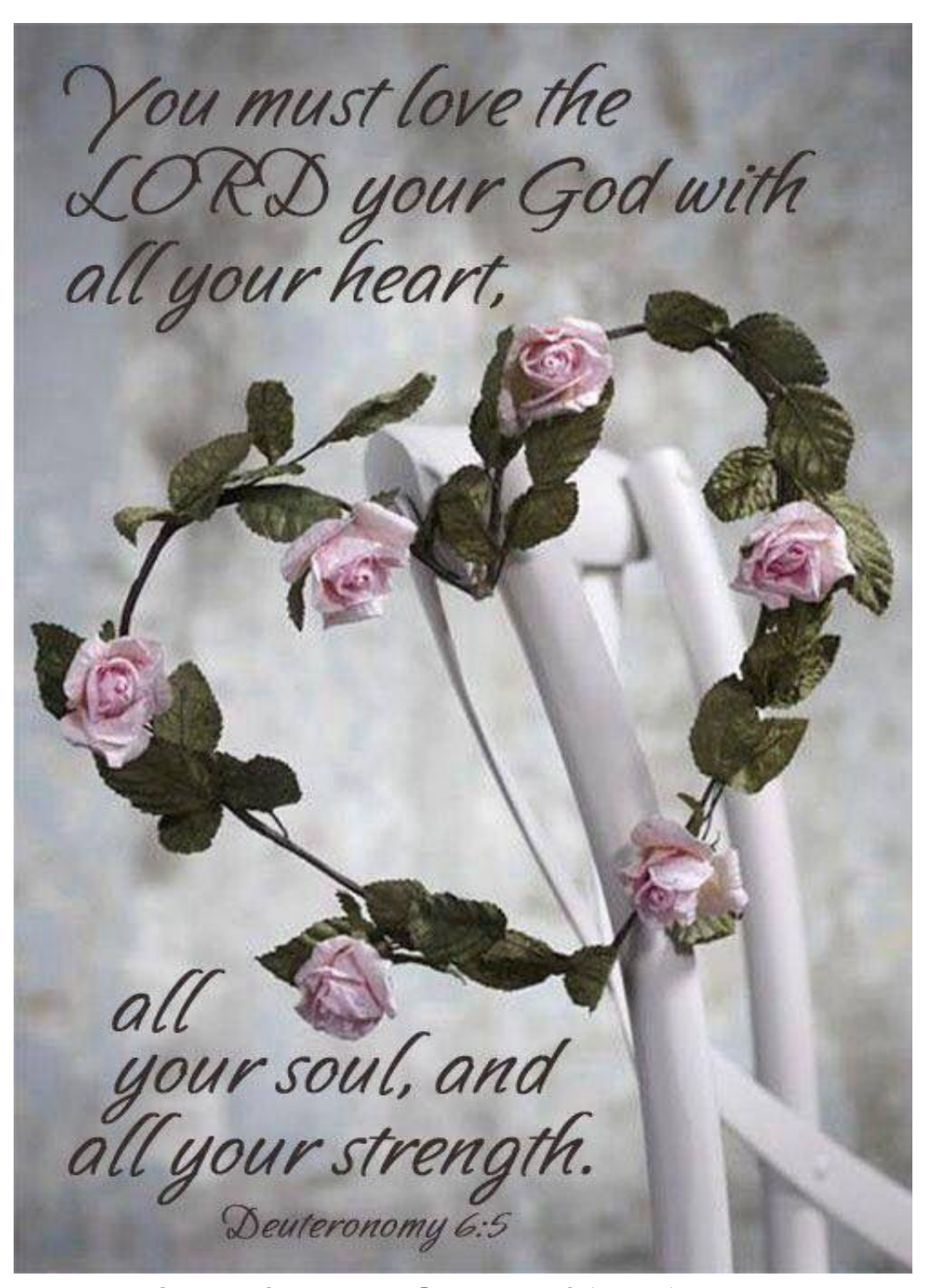
Great Swamp Baptist Church February 13, 2022