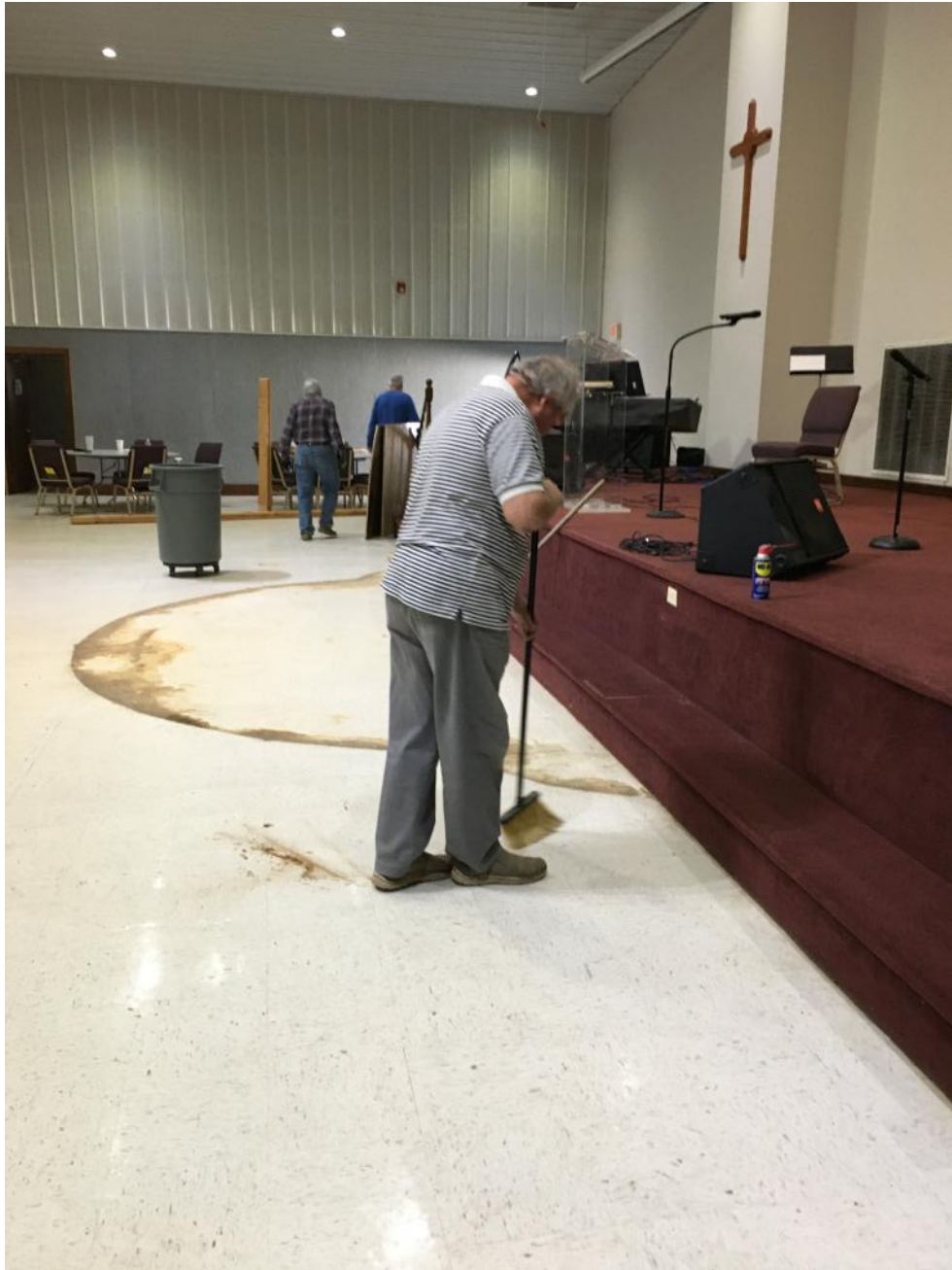
Great Swamp Baptist Church January 30, 2022