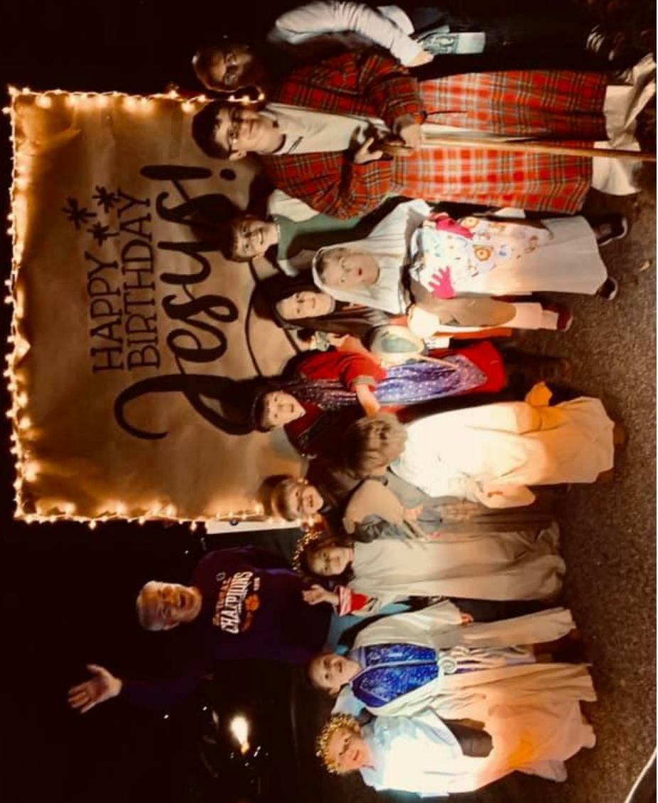
Great Swamp Baptist Church December 8, 2019