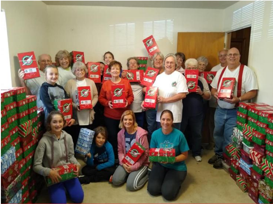
Shoe Box Packing Party 2019