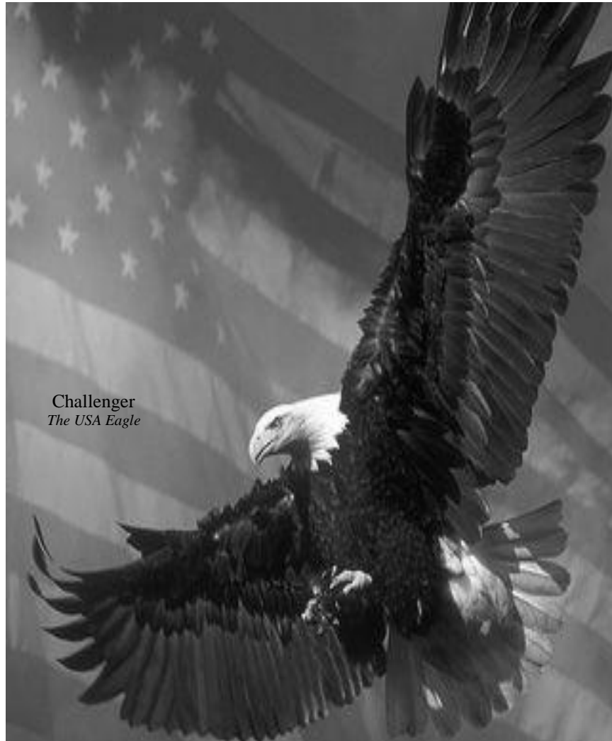
Challenger The USA Eagle