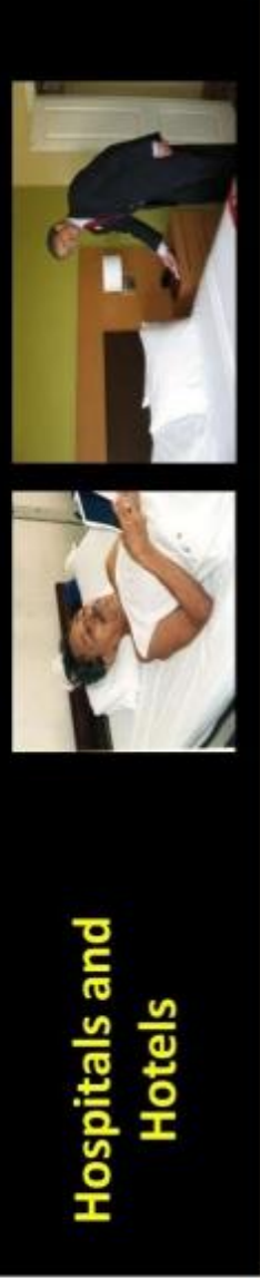
Hospitals and Hotels