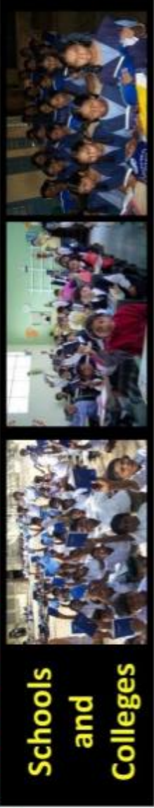
Schools and Colleges