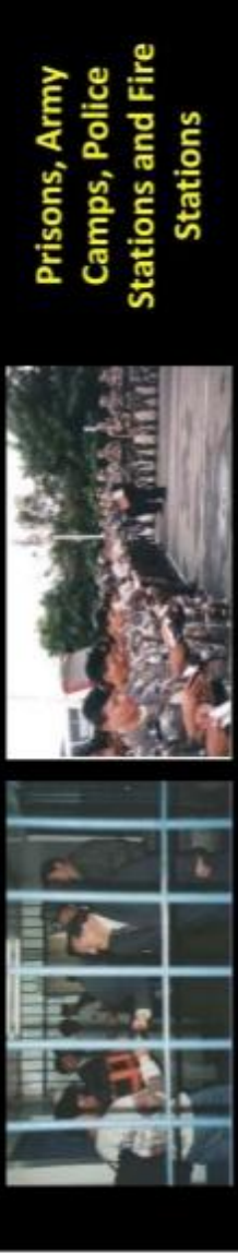
Prisons, Army Camps, Police Stations and Fire Stations